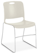
Maestro High Density Stack Chair