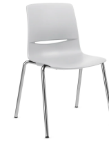
LimeLite Stack Chair