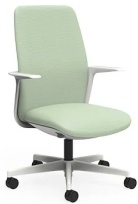
Task & Conference Chair ›

Zentori seating brings a soft, residential feel to professional settings. Its chair and stool models balance comfort, performance, and cohesive design across a range of environments. Whether used in task settings, conference rooms, stool-height collaboration spaces, or executive offices, Zentori delivers a consistent aesthetic with versatile functionality.