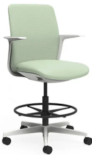
Task Stool ›