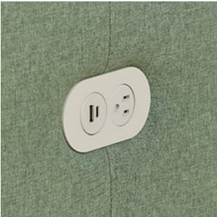
120V & USB-A+C