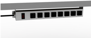
Undermount R8 W16.3" D3.2" H2.8" *Available in silver only