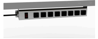
Undermount R8 W16.3" D3.2" H2.8" *Available in silver only