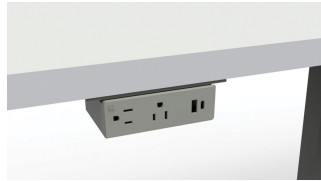
Miki Undersurface W5.8" D3.1" H1.54"