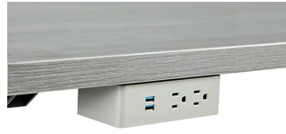
Ashley Duo W5.5" D2.8" H1.8"