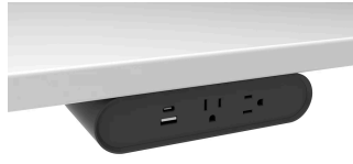
Dubbel Undersurface W7.6" D3.8" H2"