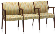
Multiple Seating >