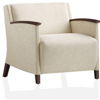
Bariatric Chair >