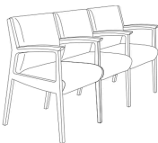
Three Seats W69" D24" H33.75" Seat: W21" D17.5" H19" Arm Height: 27.75"