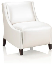
Lounge Seating >