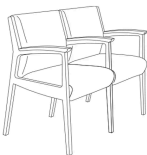
Two Seats W47" D24" H33.75" Seat: W21" D17.5" H19" Arm Height: 27.75"