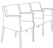
Three Seats W69" D24" H33.75" Seat: W21" D17.5" H19" Arm Height: 27.75"