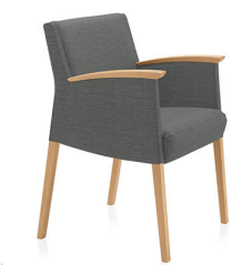
Guest Chair >

Elevate healthcare and public spaces with the Soltice Collection, where timeless design meets residential warmth for a welcoming, comfort-driven experience.