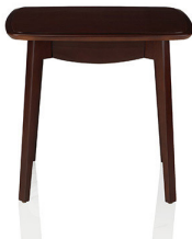
Occasional Tables >