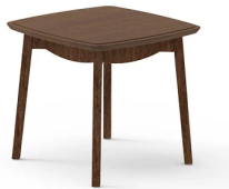
Occasional Tables >