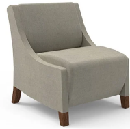
Lounge Seating >