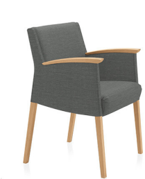
Guest Chair >

Elevate healthcare and public spaces with the Soltice Collection, where timeless design meets residential warmth for a welcoming, comfort-driven experience.