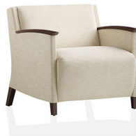
Bariatric Chair >