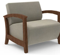
Bariatric Chair >