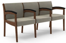
Multiple Seating >