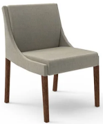
Guest Chair >

Elevate healthcare and public spaces with the Soltice Collection, where timeless design meets residential warmth for a welcoming, comfort-driven experience.