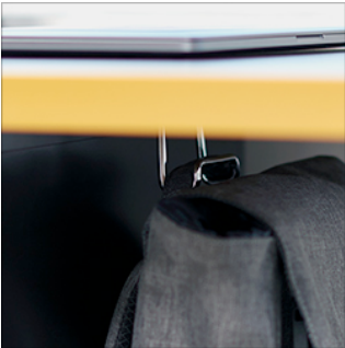
Book Bag Hook