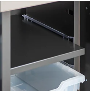
Removable Steel Shelf