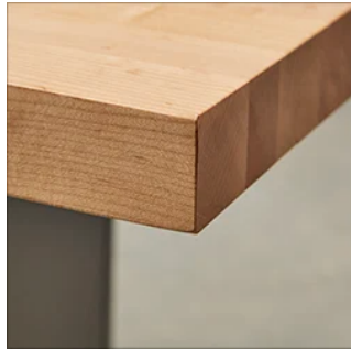
Butcher Block Wood 1.75" WBB Edge