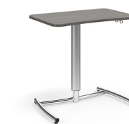
Cantilever Desks >