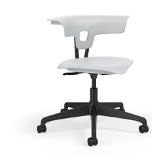
Task Chair >