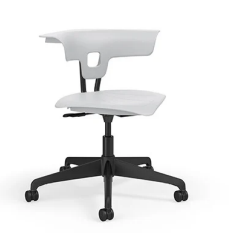
Task Chair >