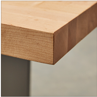
Butcher Block Wood 1.75" WBB Edge