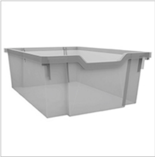
6" Tote *Tote lid ordered separately