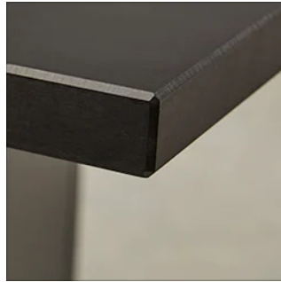
Phenolic Resin 1" RNT Edge