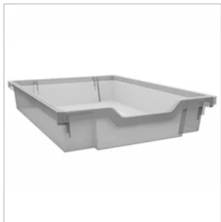
3" Tote *Tote lid ordered separately