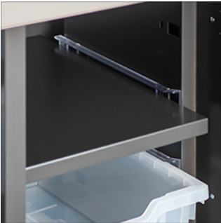
Removable Steel Shelf