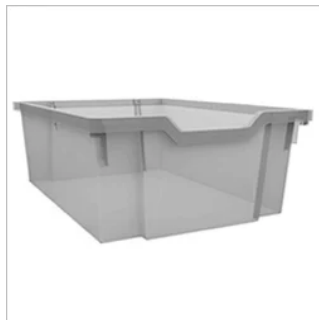
6" Tote *Tote lid ordered separately