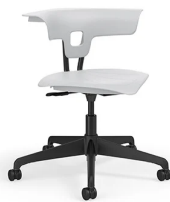
Task Chair >