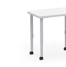
Post-Leg Desks >