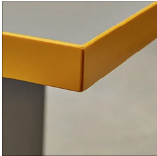
Laminate 1.25" 74P Edge