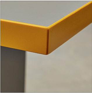
Laminate 1.25" 74P Edge