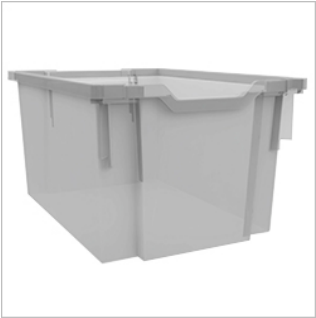
9" Tote *Tote lid ordered separately