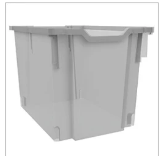
12" Tote *Tote lid ordered separately