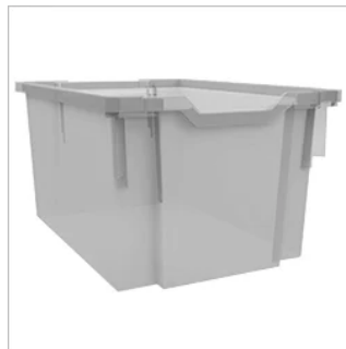
9" Tote *Tote lid ordered separately