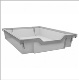
3" Tote *Tote lid ordered separately