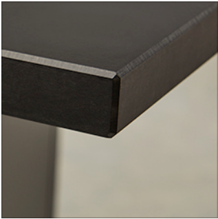
Phenolic Resin 1" RNT Edge