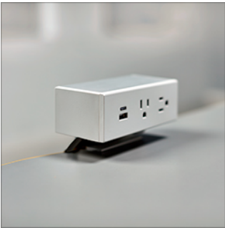
Dean Clamp-On *Available with Qi charging