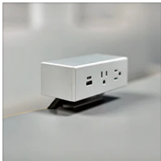
Dean Clamp-On *Available with Qi charging