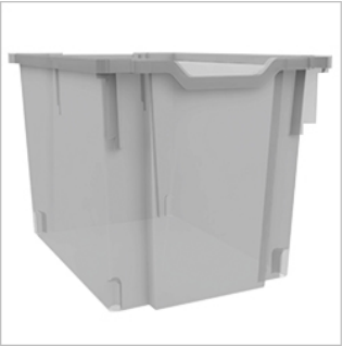
12" Tote *Tote lid ordered separately