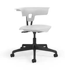
Task Chair >