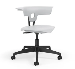
Task Chair >