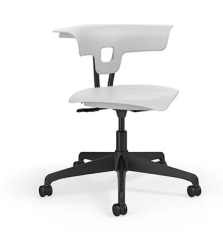
Task Chair >