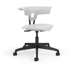
Task Chair >