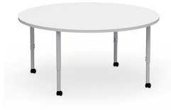
Activity Tables >