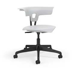
Task Chair >