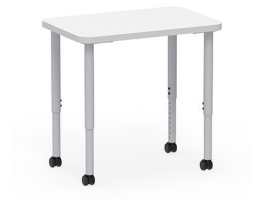
Post-Leg Desks >