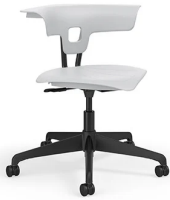
Task Chair >