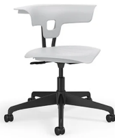
Task Chair >