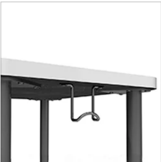
Book Bag Hook