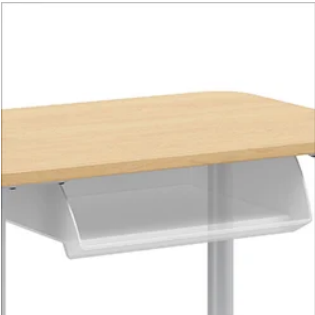
Poly Book Box *Available in Small and Large Sizes