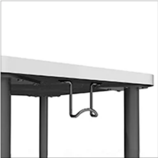
Book Bag Hook