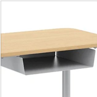
Steel Book Box *Available in Small and Large Sizes