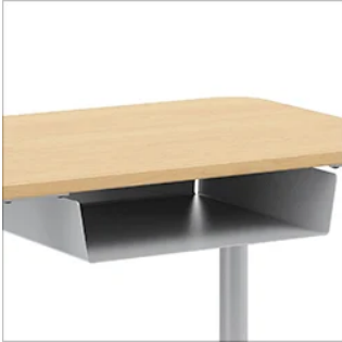
Steel Book Box *Available in Small and Large Sizes