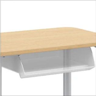
Poly Book Box *Available in Small and Large Sizes