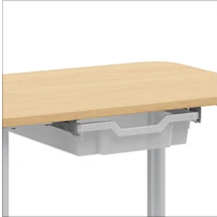
Removable Book Box