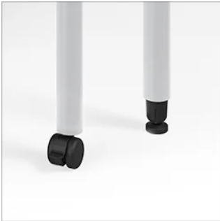
Casters and Glides