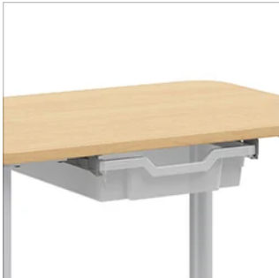
Removable Book Box