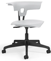
Task Chair >