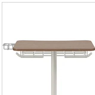
Swiveling Cup Holder and Book Basket *Available Left- or Right-Side