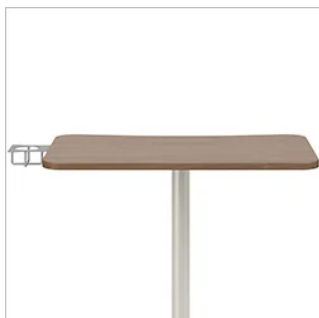
Swiveling Cup Holder *Available Left- or Right-Side