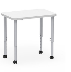
Post-Leg Desks >