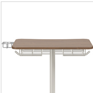
Swiveling Cup Holder and Book Basket *Available Left- or Right-Side