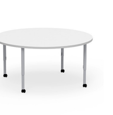
Activity Tables >