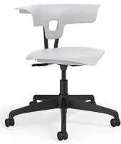
Task Chair >