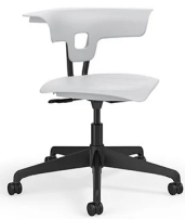
Task Chair >