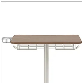
Swiveling Cup Holder and Book Basket *Available Left- or Right-Side