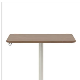
Book Bag Hook *Available Left- or Right-Side