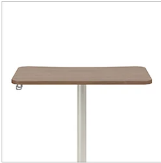
Book Bag Hook *Available Left- or Right-Side