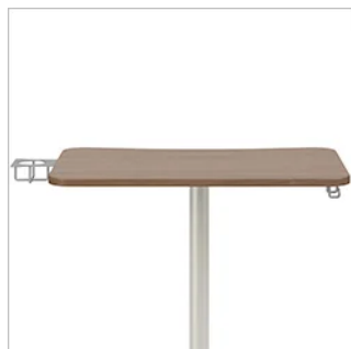
Swiveling Cup Holder and Book Bag Hook *Available Left- or Right-Side