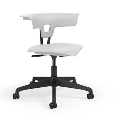
Task Chair >