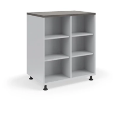
Ruckus Storage >