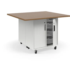
Ruckus Worktables >