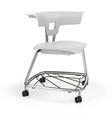
Ruckus Chair >

It's not so much an evolution as a revolution. It looks like nothing else. It can be used like nothing else. It's Ruckus: a simple, inspiring and incredibly innovative collection that supports today's learning space transformations.