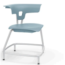
18" Seat Height with Glides W28" D29" H29.5" Seat: W22.3" D18.8" H18"