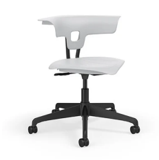
Ruckus Task Chair >