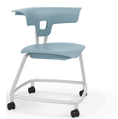
18" Seat Height with Casters W28" D29" H29.5" Seat: W22.3" D18.8" H18"