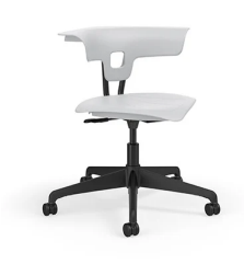
Task Chair >