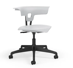
Task Chair >