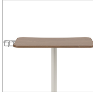
Swiveling Cup Holder