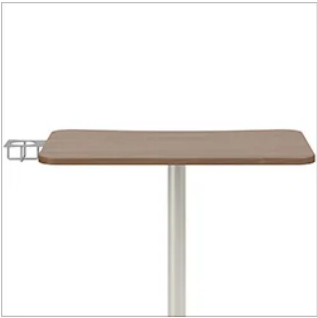
Swiveling Cup Holder *Available Left- or Right-Side