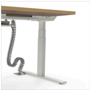
Vertical Wire Manager