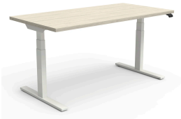
T-Leg W 48, 54, 60, 66, 72" D 24, 30" H 22–48"