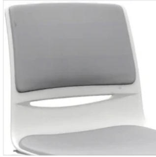
Upholstered Seat and Backrest