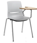
Flip Up Oversize Tablet Arm W23.75" D31" H33.25" Seat: W18.25" D17.5" H17.5"