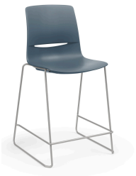
High-Density Stack Stool