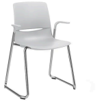
Cantilever Arm W24.75" D20" H33.25" Seat: W18.25" D17.5" H17.5"