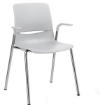
Cantilever Arm W23.5" D22.25" H33.25" Seat: W18.25" D17.5" H17.5"