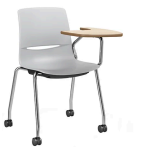
Flip Up Oversize Tablet Arm W23.75" D31" H33.25" Seat: W18.25" D17.5" H17.5"