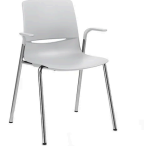
Cantilever Arm W23.5" D22.25" H33.25" Seat: W18.25" D17.5" H17.5"