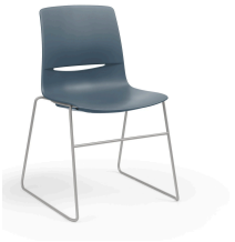
High-Density Stack Chair