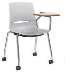
Flip Up Tablet Arm W23.75" D28" H33.25" Seat: W18.25" D17.5" H17.5"