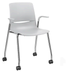
Cantilever Arm W23.5" D20" H33.25" Seat: W18.25" D17.5" H17.5"