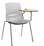
Flip Up Oversize Tablet Arm W23.75" D31" H33.25" Seat: W18.25" D17.5" H17.5"