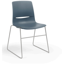
High-Density Stack Chair