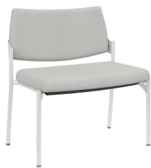
XL Bariatric Chair