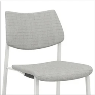
Upholstered Seat and Back