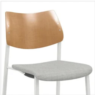
Upholstered Seat and Wood Back