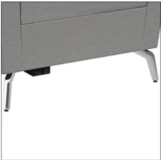
Power Module *Available in Black or White