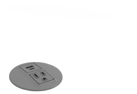
Node In-Surface Dia.3.38" H3.3"