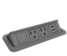
Nacre Pop-Up W7.25" D3.3" H2.92"