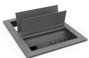
Double Ellora B W10.19" D8.31" H2.71"