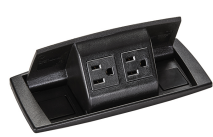
PowerUp W7.18" D3" H2.92"