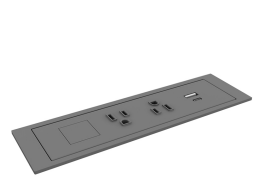
Dean In-Surface W8.12" D2.3" H2.5"