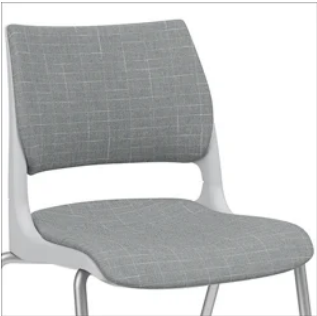
Solid Poly with Upholstered Seat and Back