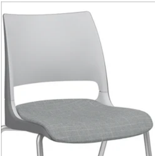
Two-Tone Poly with Upholstered Seat