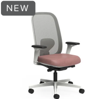
Task Chair >

Civara task chairs and stools infuse any workspace with refined sophistication, seamlessly blending aesthetics, well-being, and ergonomic performance. Offered in a range of mesh or upholstery options and three frame finishes, Civara delivers exceptional support for long work sessions, proving that high performance and high design can coexist beautifully.