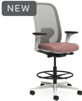
Task Stool >