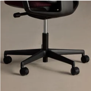
Plastic *Available in black, white, or warm grey