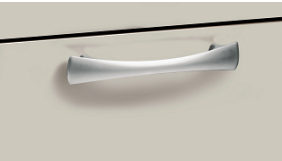
Aluminum Bow Tie ALBT