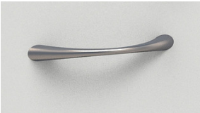
Arc Nickel ARCN