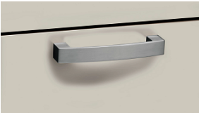
Aluminum Metric ALMT