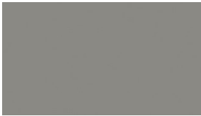
Warm Grey WG