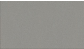
Starlight Silver Metallic (flat Aluminum Trim Only) SX

Approvals for KI surface materials are subject to change. Please visit ki.com/surfacematerials to view the latest material approvals.