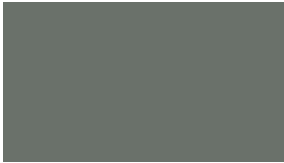
Blue Grey GR