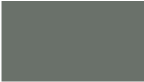
Blue Grey EGR