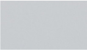
Cool Grey PCG