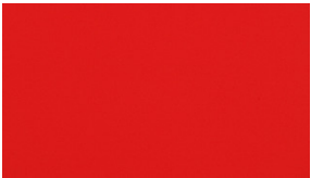
Poppy Red PPR