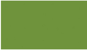
Zesty Lime PZL