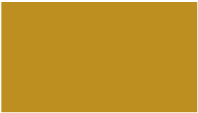
Honey Bee PHY