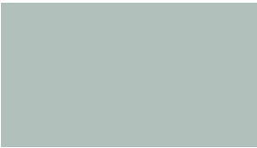
Hazy Jade PHJ