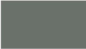
Blue Grey PGR