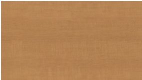
Monticello Maple LBMT