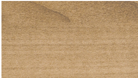
Dolce Vita LBDV