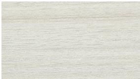
White Chocolate LBWZ

Approvals for KI surface materials are subject to change. Please visit ki.com/surfacematerials to view the latest material approvals.