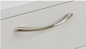
U-series pull (standard)